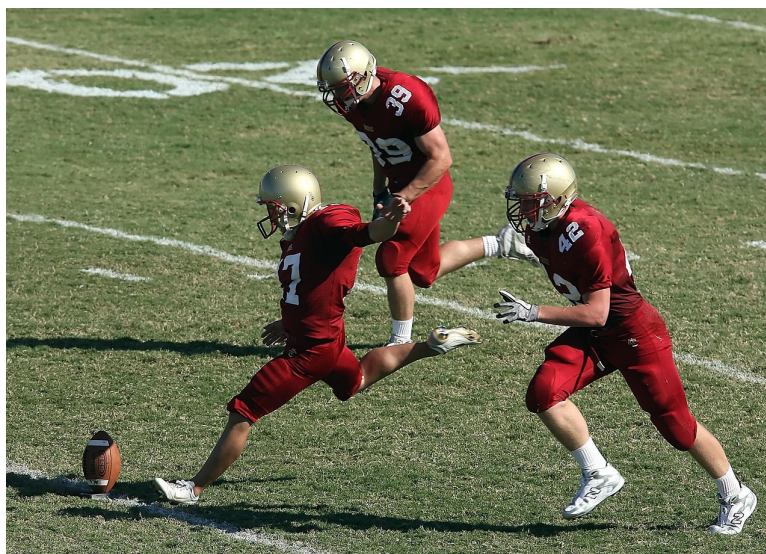
Image from Pixabay, June 27, 2016. Source: https://pixabay.com/photos/football-american-football-1481798/

In this Lab you will write Python code and run it. You can write the code yourself or get an LLM to do it. Run the code in Google Colab. If it does not run correctly, rewrite until it works correctly.